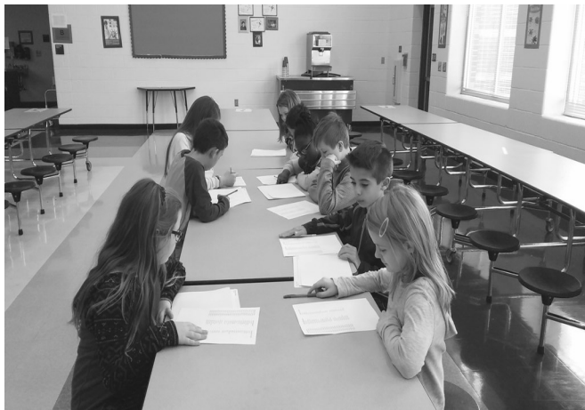
Bain Ambassadors meet to discuss peer mediation training designed to help students work through conflict.

Another reason that we do not have a lot of bullying at Bain is because we started learning in